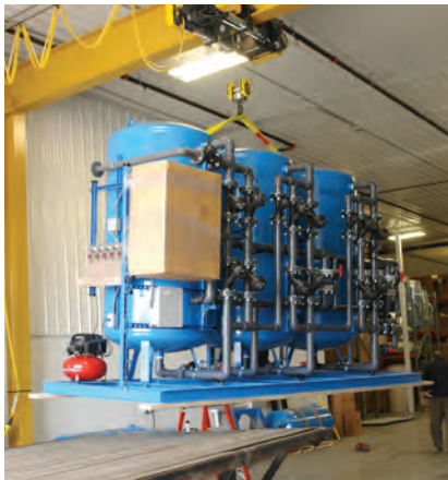
Loading the MRS™ for shipment

Unlike other methods which pay little or no attention to the types of media combinations employed, the MRS™ relies on specific granular media mixtures to perform a specific treatment activity. Not all media will perform the same in all types of water chemistries. More than a decade of research was spent in isolating the most effective media to use in a range of MRS™ system configurations that address the changing treatment goals in differing types of water.