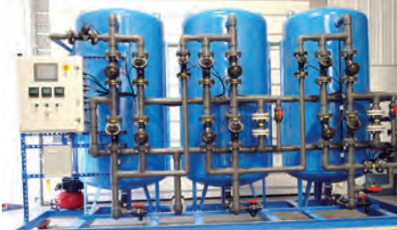
MRS™ unit built under our CustomCare line

The MRS™ by Plymouth Technology in Rochester Hills, Michigan is built around an advanced adsorptive wastewater treatment process that uses naturally occurring non-toxic, granular substrates in specially developed mixtures, which reduce and adsorb target compounds from solution, or target compounds into their adsorptive chemical components.