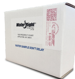
Water Sample Kit

Once complete, the test results will be sent back to you, to be used at your discretion. Please note... The complimentary lead testing service will be provided until we feel confident that the new packaging design will protect the cartridge during shipping and the cartridge performs as expected.