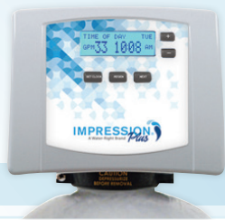
Impression Plus® model shown with backlit display and top flange