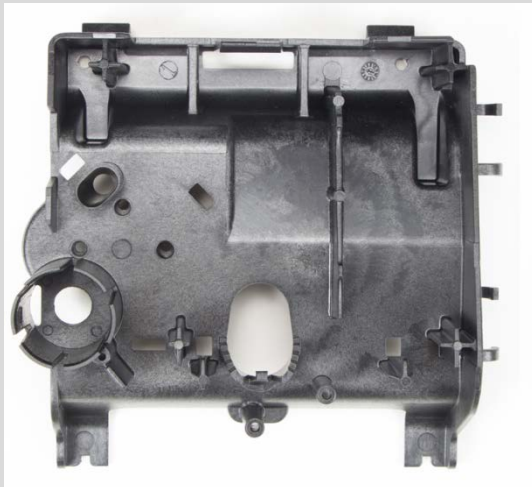
Old Drive Bracket