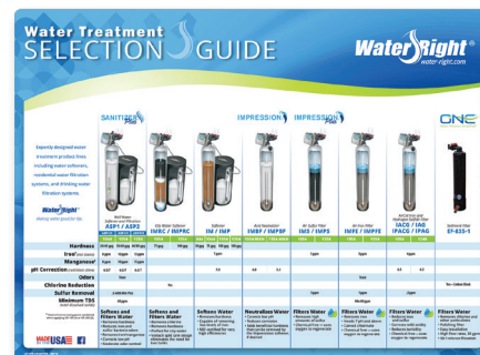
14"x19" Counter Mat

As we develop more items, we will post them. To find out how to login, call us at 1-800-777-1426 and ask for the marketing department.