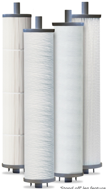
'Stand off' leg feature

These filters not only give you higher flow rates, but also six times the loading of that over a big blue, that's right six times (6x) more surface area. The more common use for this configuration is the 3 micron carbon block which is rated for 250,000 gallons at 2 ppm of free chlorine.