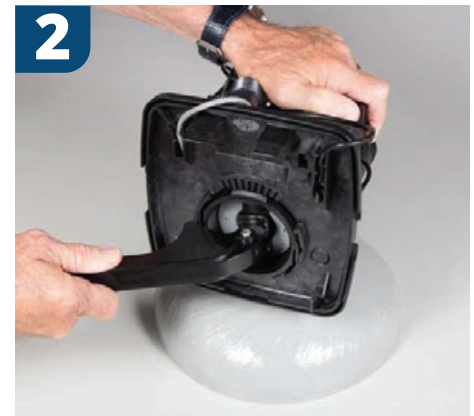
Bend handle to the side to engage stack