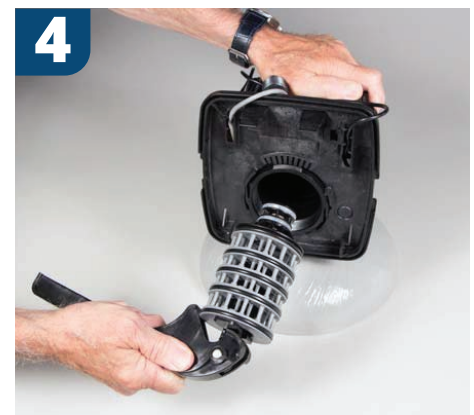
Pull to remove the stack