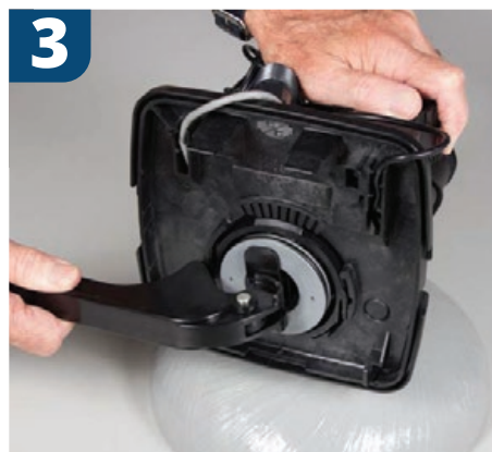
Continue to push handle in