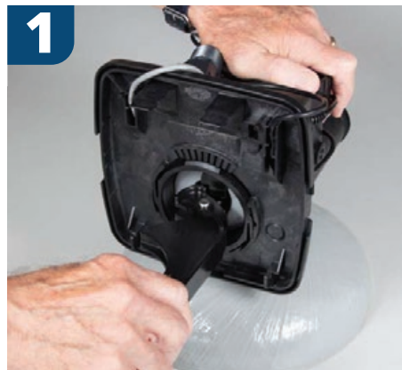
Insert puller into stack