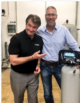
Teaching service call procedures on control valve.