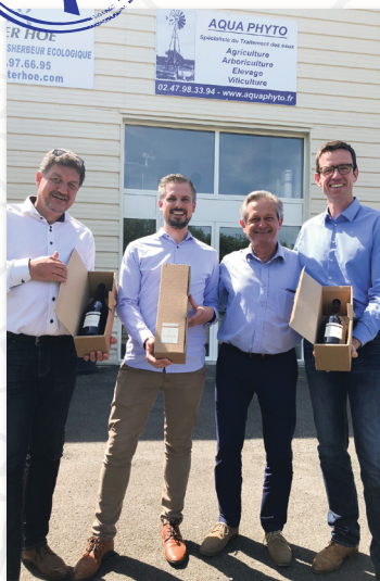
The French are very generous!