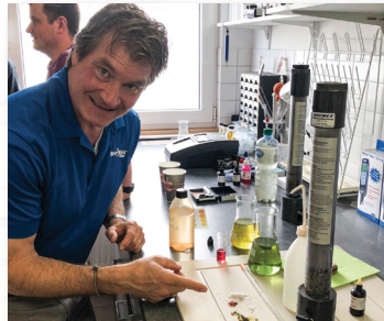
Checking the quality of Crystal-Right media.