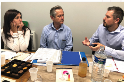
Schooling on Crystal-Right applications.