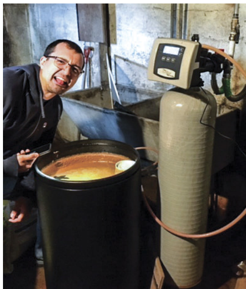
2M inspecting brine tank full of mystery substance.

This is the situation as it was described: ASP series 4 years old, worked great up until 6 months ago, using too much salt now but the water is fine, water on basement floor every week or so near floor drain.